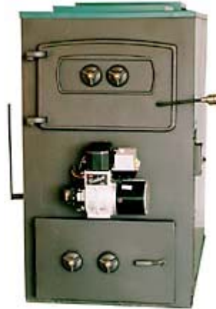
Hand-fired coal or oil-fueled unit